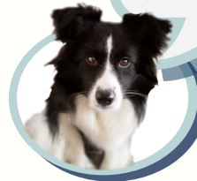
Ruby - Bright Futures Cuddle Provider

If you need a professional eye to check over the EHCP , you can request that Bright Futures conducts an EHC Check here .