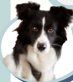
Ruby - Bright Futures Cuddle Provider

We know how overwhelming and frustrating the Education, Health and Care Plan (EHCP) process can be. If you're involved in any way (as a parent, school, or professional), Bright Futures can help you navigate the complex legal system of Education, Health & Care Plans (EHCPs).